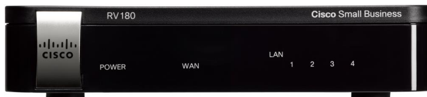
Figure 1. Cisco RV180 VPN Router (Front Panel)

Secure, high-performance connectivity at a price you can afford.